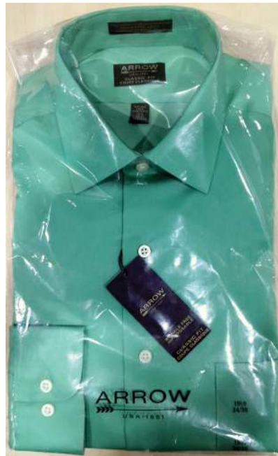
Figure D1: A shirt which can be manufactured from cotton and/or polyester