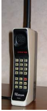
Figure E4: “Candy bar” mobile phone