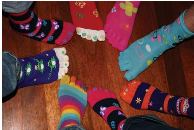
Figure D2: Socks manufactured in wool and nylon