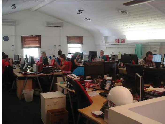
Figure E2: "Bullpen" open-plan office