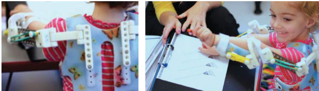
Figure C1: A small child fitted with a lightweight plastic exoskeleton

[Source: Wilmington Robotic Exoskeleton (WREX) developed by researchers at Nemours/ Alfred I. Dupont Hospital for Children. Used with permission.]