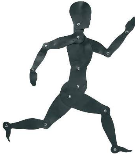
Figure E1: 2D plastic anthropometric model